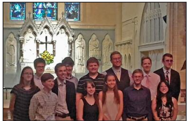
Closing Student Recital at Church of the Redeemer

The daily lessons that form the core of every POE experience employed fourteen volunteer teachers and twenty-eight organs. We are grateful to all the organists, secretaries and sextons who met us early for scheduled lessons each morning, but we are especially grateful to First Presbyterian, Philadelphia and to Church of the Redeemer, Bryn Mawr. We did go to both of these, our contingency/emergency venues! Housing was at Girard College, where two lucky students took lessons. Bryn Mawr Presbyterian was another hub for a carillon concert (followed by console time!), rehearsals, and one of our student recitals.