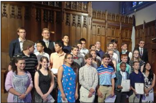
Closing Student Recital at Bryn Mawr Presbyterian Church

The Philadelphia Chapter hosted our third Pipe Organ Encounter in twenty plus years July 8-13, 2018. Pipe Organ Encounters are designed and supported by AGO National to introduce teenagers with intermediate keyboard proficiency to the pipe organ. We hosted twenty-seven students, 12 to 18 years old, from nearby AGO Chapters, as well as from more distant states such as Maine to Tennessee. Some were new transfers from piano, while a few were experienced POE veterans.