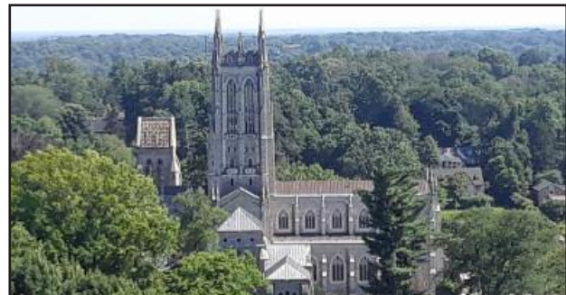
Bryn Athyn Cathedral